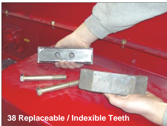
38 Replaceable / Indexible Teeth